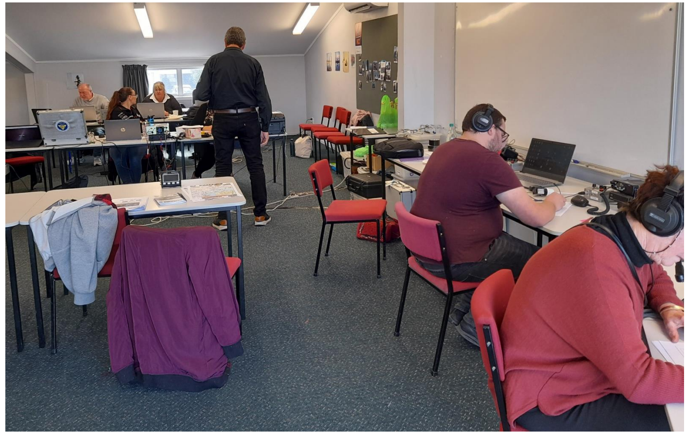
Above: Rally Base with the radio operators on the right.

The Rally was run from the HB Coastguard building in Napier which we use for LandSAR operations. It has several fixed antennas already set up, all we had to do was plug into them. It was a great setup and included a kitchen off to the side so anyone was within hearing if needed.