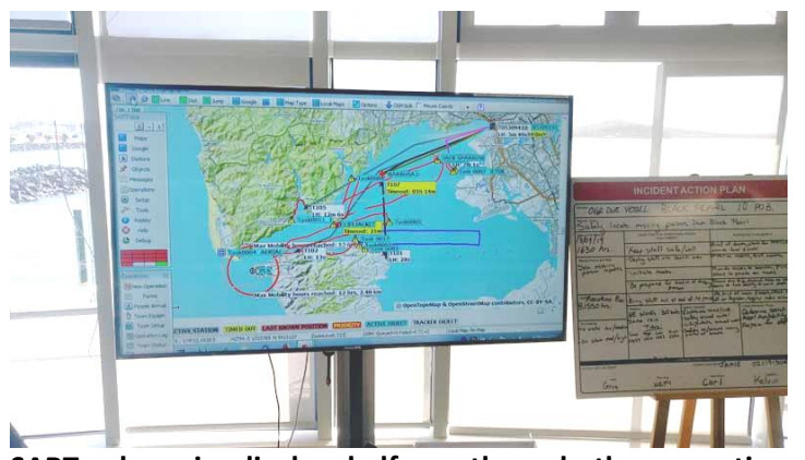
SARTrack main display halfway through the operation showing search areas and tracks of search vessels.

Over the weekend of September 13-15, a major multi-agency search and rescue exercise was held in Auckland's Manukau Harbour. The participants were the Police Maritime Unit, Police Search and Rescue Squad, Coastguard, Surf Lifesaving Northern Region, Manukau Harbourmaster, NZ LandSAR, Auckland Airport Rescue Fire Service and AREC.