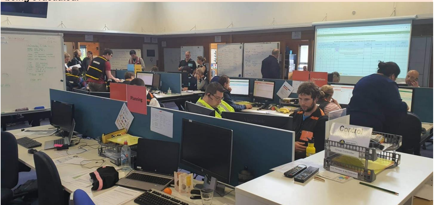
An overview of the Southland Civil Defence Emergency Operations Centre.

In early February, a state of emergency was declared in areas of Southland following the Mataura river flooding. This saw residents from Gore, Wyndham, Riversdale, Matura and surrounding areas being evacuated.