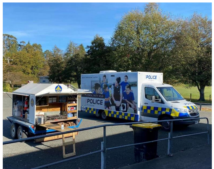
Civil Defence trailer and Police Community Hub.