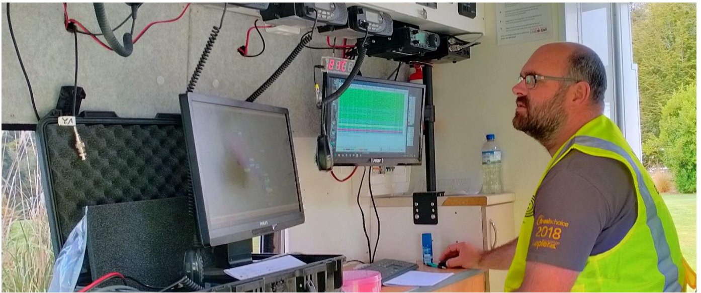
Above: Brendon ZL4BDS using SAR Track to record radio messages and keep tabs on the location of the teams.